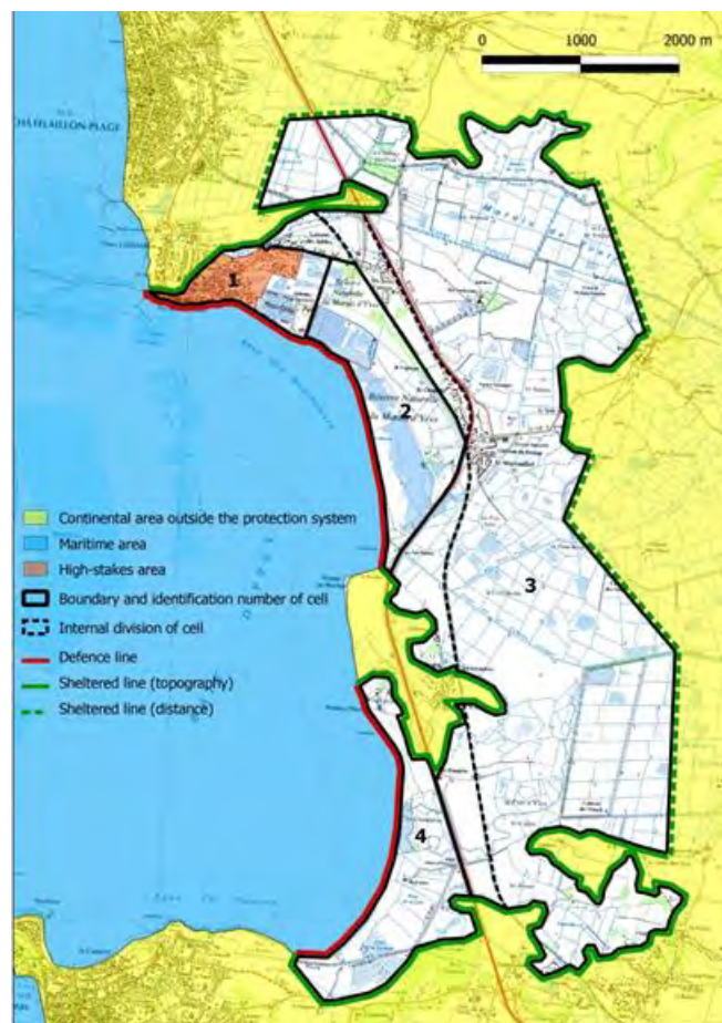
Figure 2. Les Boucholeurs system schematization.

Port Punay canal, that crosses the urbanized zone, provoked its flooding by orientating flows in this low-lying sector. At its outlet, low discharge didn't contribute significantly to the inundation but after the storm the discharge was also too low to evacuate the water. This led to a detrimental inundation for many days.