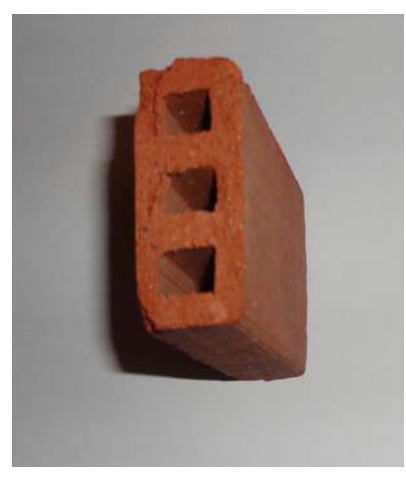
Larache sediment Figure 3. Bricks manufactured with a substitution rate of 70% of sediments, the same size 2.5×5.0×7.5 cm.