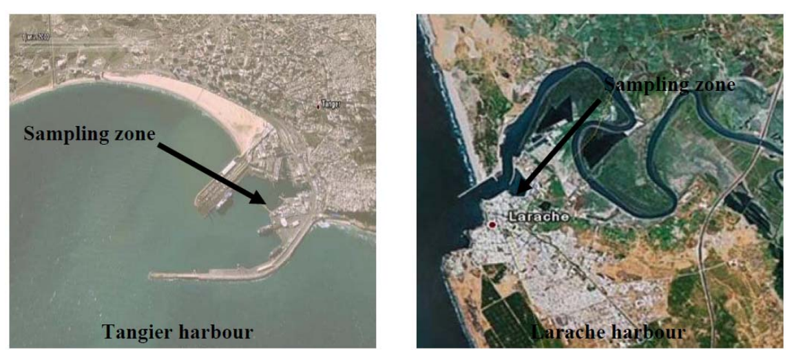
Figure 1. Zones of sampling of sediments.

The sediments studied in this work were collected from the ports of Tangier and Larache (figure 1). Thanks to its strategic location between the Atlantic and the Mediterranean Tangier port is Morocco's leading port in passenger traffic and international transit roads.