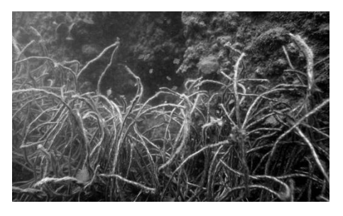
Seagrass module used on pile wharfs