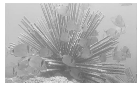
Urchins module used on riprap dikes

The second solution has been designed to improve micro-habitats complexity of rip-rap dikes composed of large (metric scale) limestone boulders and to reduce the important slope of such infrastructures in order to get closer to the characteristics of natural nurseries. It is bio-inspired by the symbiosis relation between long spine sea urchins and some tropical fish species which find protection between the spines (GOULD et al. , 2014). A unitary "Oursin<sup>©</sup>" module looks like a giant long spine sea urchin. The semi-spherical module represents a total diameter of 1 m for a unitary volume of 0.26 m<sup>3</sup>. Spaces between each 161 long and flexible spines create on the extern part of the module numerous suitable micro-habitats for the protection of early life stages of marine fish. The inner part of the module offers a cavity where only little cryptic individuals of few centimetres can be found.